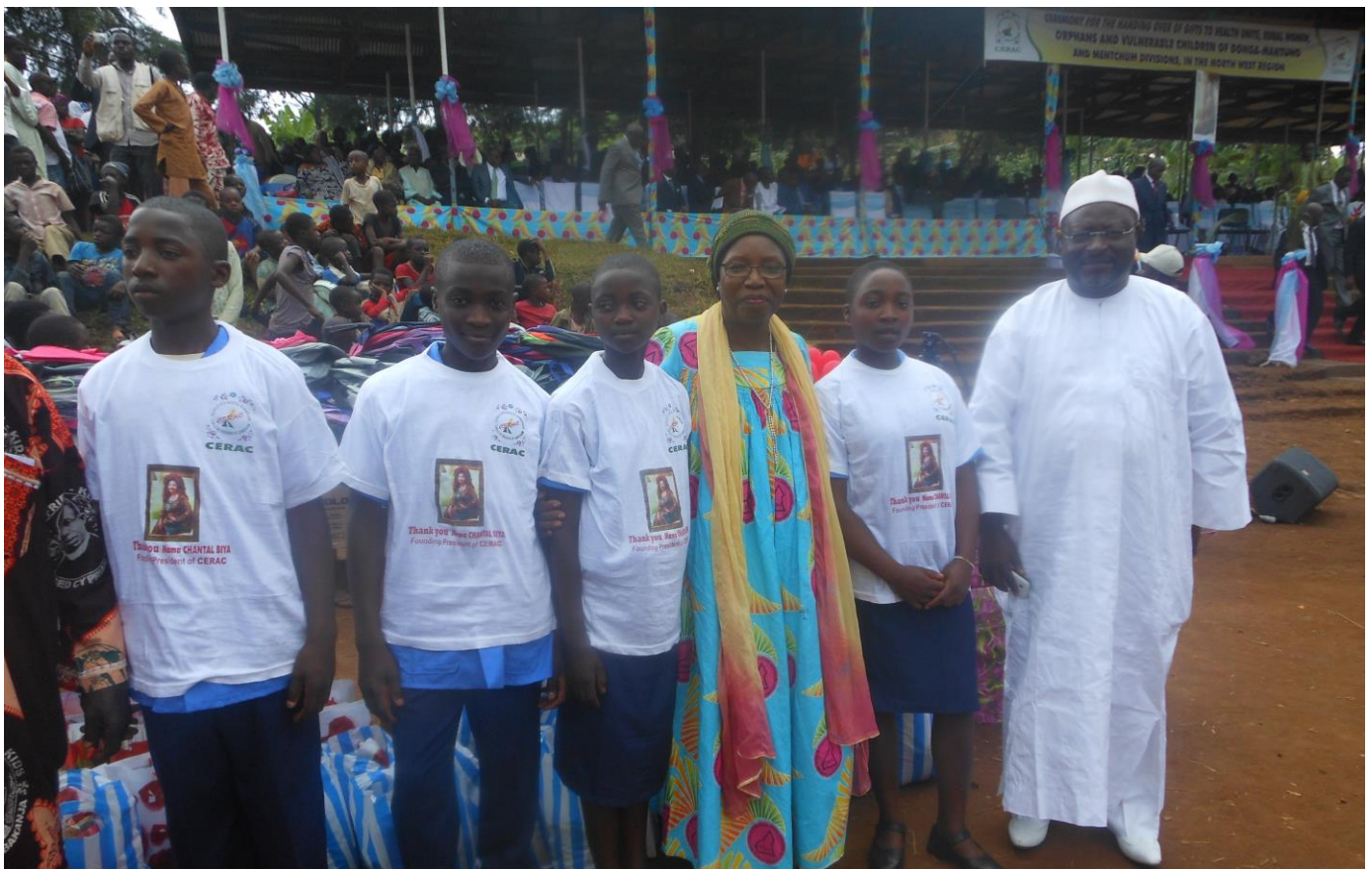
FORCE-CAM's representation in Wum with CERAC Social Affairs Coordinator